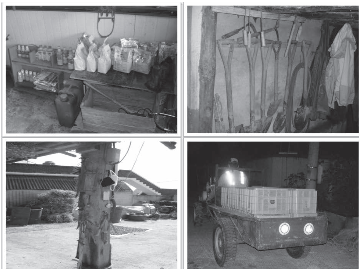
Fig. 2. Examples of improvement: Pesticide storage using a book self, storage for agricultural devices, home for small tools, reflective signs for night safety.

the farmers' own ideas and available local resources, they initially started with small, easy-to-implement improvements. Once farmers are trained in the participatory steps leading to the actual improvements, they can apply the sequential steps in a sustainable way to manage agricultural work-related risks. We can expect that they would expand their scopes to more challenging improvements in a step-wise manner (Fig. 2).