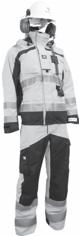
Fig. 1. The new outer layer jacket and pants developed in the innovation project.

the stages of 1) Establish insights of user needs and context of use , 2) Specify design objectives , 3) Design new solutions , and 4) Evaluation 28 ). Petroleum workers were involved throughout the design process; in establishing user insights, in concept development by participatory design, and in evaluating the design via field testing.