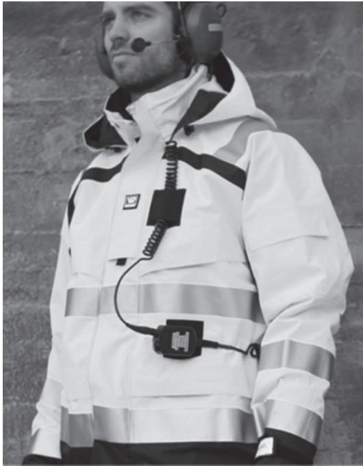
Fig. 2. The new jacket solution for cable management.

the work coveralls. Radio cables run freely from the radio unit to a push-to-talk unit (PTT), and then up to the hearing protectors mounted on the helmet. The PTT is attached with a clip to the front of the PPC anywhere the users can make it stick. The radio cables represent a risk of snagging and a source of irritation, and this issue was pointed out by several users following the first field test. When working in heights, a detachment of the radio cable involves a safety risk by loss of communication with the support crew on deck. Thus, a specific solution for cable management was developed (Fig. 2). Users pointed out practical positions for attachment of the PTT, based on considerations of easy-access and limited risk of snagging, and tailored patches dedicated for sturdy attachment of the PTT was incorporated in the design. The PTT can be attached at two alternative positions, and the patches are compatible with PTTs from different suppliers, which have the attachment clips oriented opposite ways. They also function as tunnels for the radio cable to keep it in place close to the body.